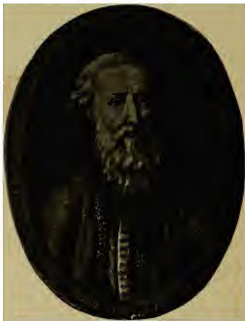
ARTAMON MATVYEEV. THE GREAT REFORMING BOYAR.