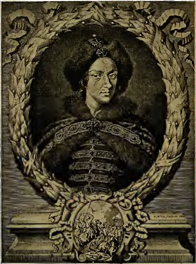
PETER THE GREAT IN HIS SIXTEENTH YEAR.