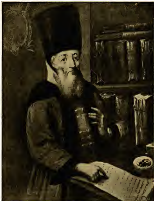
THE FIRST RUSSIAN CHANCELLOR. ANASTASY ORDUIN-NASHCHOKIN.