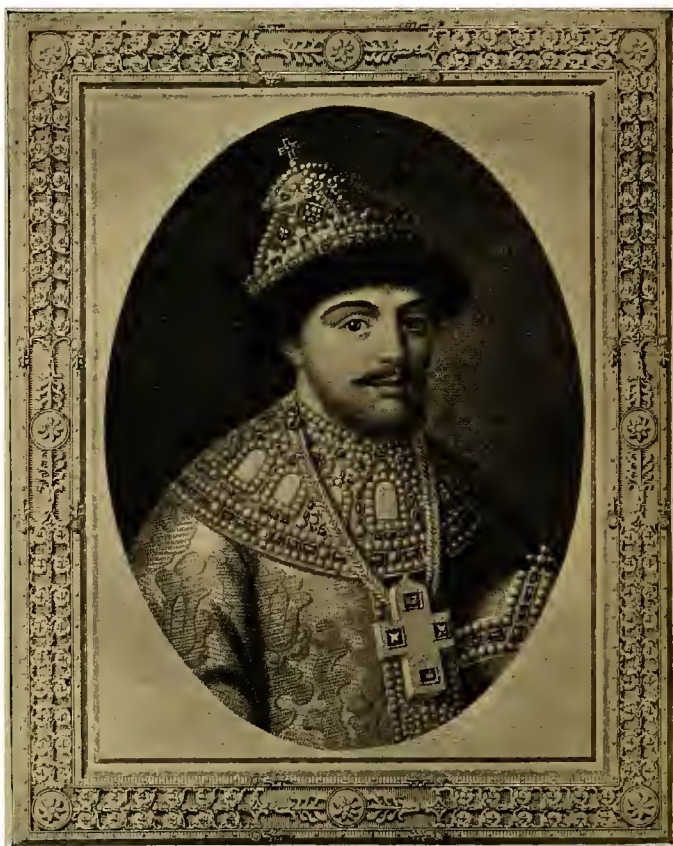
TSAR THEODORE III.