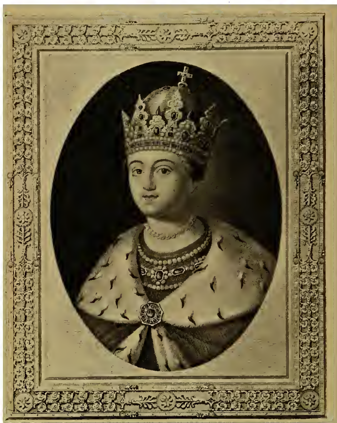
THE TSAREVNA SOPHIA ALEKSYEYEVNA.